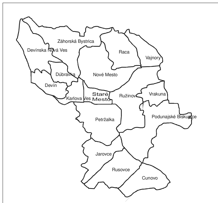
FIGURE 1 City quarter Staré Mesto (Old Town) within administrative division of Bratislava

for all planning procedures. The most important regulatory document is the Master Plan ('Územný Plán' – UPN – in Slovak). The replacement of the outdated Master Plan started in 1998 and the new one is expected to be accepted by the City Council in 2006. It has to be adapted to the new development processes and it has to respect the needs of citizens, as well as of investors. The Master Plan is to be supplemented by a large number of more detailed planning documents, e.g. the plans of zones. It is important to note in connection with the regulation of urban development that large areas of Staré Mesto belong to monument protection areas. The historical core and the castle area is strictly protected as City Monument Reserve, and the wider territory of Staré Mesto is designated as City Centre Monument Zone, with a weaker regime of monument preservation.